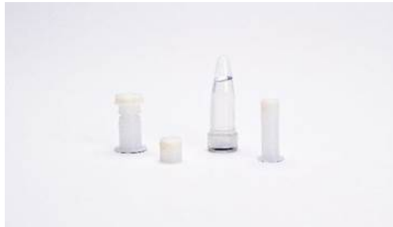
Figure 2: Unyvero sample tube, sample tube cap, sample pre-treatment tool and Master Mix tube

The Unyvero A50 Analyzer instrument consists of mechanical, electronic, pneumatic and optical elements and enables a fully-automatic random-access processing of the Application Cartridges. Once a run is started, the Unyvero A50 Analyzer automatically executes and controls all sample processing and analysis steps (including DNA extraction, DNA purification, PCR set-up, highly multiplexed end-point PCR amplification and a hybridization array-based fluorescence detection) inside the Application Cartridge. For safety and equipment longevity, and to avoid issues of calibration or waste-removal, the Unyvero A50 Analyzer contains neither reagents nor waste. All fluids are handled within the sealed Application Cartridge. Up to four Unyvero A50 Analyzers can be attached to a single Unyvero C8 Cockpit and each Unyvero A50 Analyzer includes the two available slots that provide full random access per Unyvero A50 Analyzer, allowing the processing of up to eight patient samples simultaneously within four to five hours. In the future, OpGen believes a further expansion to up to eight Unyvero A50 Analyzers will also be possible.