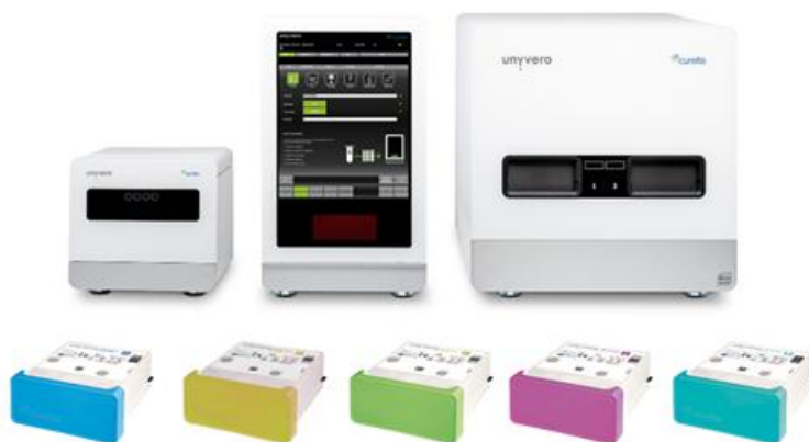
Figure 1: Unyvero A50 Platform

The Unyvero A50 System consists of three devices, the Unyvero L4 Lysator, the Unyvero C8 Cockpit and the Unyvero A50 Analyzer. The Unyvero L4 Lysator is used for sample pre-processing and pathogen lysis. The Unyvero C8 Cockpit is the control panel for the Unyvero L4 Lysator and Unyvero A50 Analyzer and displays the results of patient sample analysis. The Unyvero A50 Analyzer integrates mechanical, electronic, pneumatic and optical elements and enables a fully automatic random-access processing of the Application Cartridges. The Application Cartridges are single-use, disposable and disease specific. The Unyvero System, together with proprietary software and the Application Cartridges, comprise the Unyvero A50 Platform.